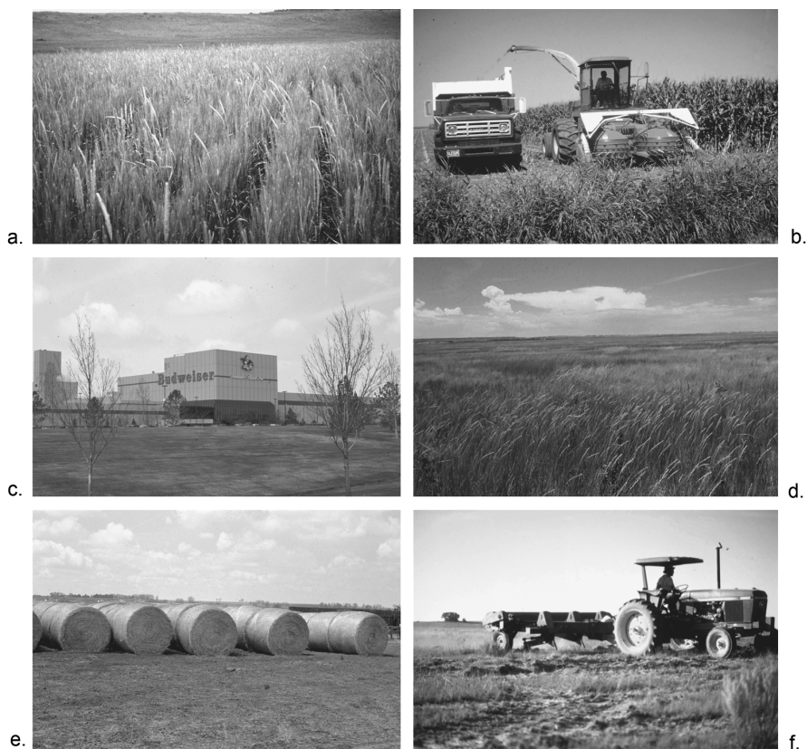
Figure 1. Grasses are most important as a source of food for humans (a. wheat field, b. harvesting corn, c. most barley production in the United States is used in the manufacturing of beer), as forage for wild and domestic animals (d. native pasture, e. hay cut from improved grass pastures), and in soil conservation (f. native range improvement practice).

The major dietary substance found in grass caryopses is carbohydrates. These carbohydrates are stored in the endosperm, nutritive tissue used during seed germination and seedling establishment, which, along with the embryo, is the major part of the grass caryopsis. The seed containing the endosperm is what the human race desires. It is what makes flour, cornmeal, rice, oats, beer, sake, and some whiskeys (Figure 1). This is why all cereal species are annual plants. Annuals put most of their energy into reproduction (creating more seeds) rather than roots and vegetative structures, which will die at the end of the growing season. The seeds used to ensure propagation of the annual species are harvested and put to multiple uses by humans. Carbohydrates in the endosperm are the substance upon which most civilizations have developed and been maintained. It is a farmer's ability to feed many individuals, not just himself and his family, that allows others to pursue such activities as the arts, manufacturing, trade, education, bureaucracies, and, alas, war—all part of the fabric of human civilizations. The classic example of endosperm is the large, white "exploded" portion of a piece of popcorn. The soft, sweet portion of a partially